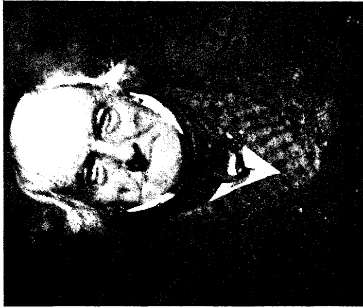
Jean Baptiste Biot