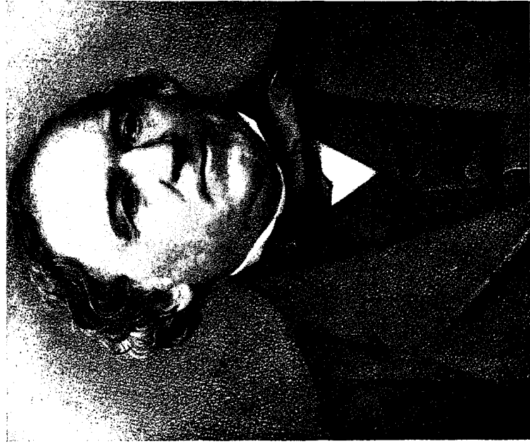
Jean Baptiste Dumas