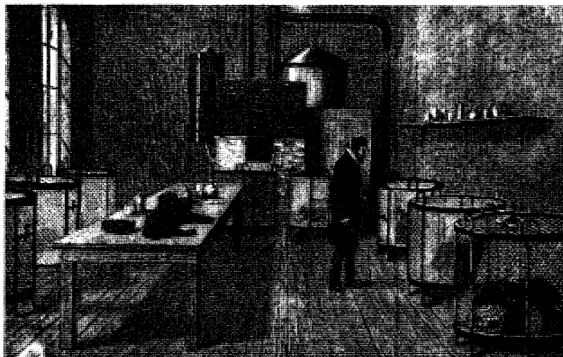
Pasteur in his laboratory of the Ecole Normale. Reproduced from the Journal Illustré, March 30, 1884