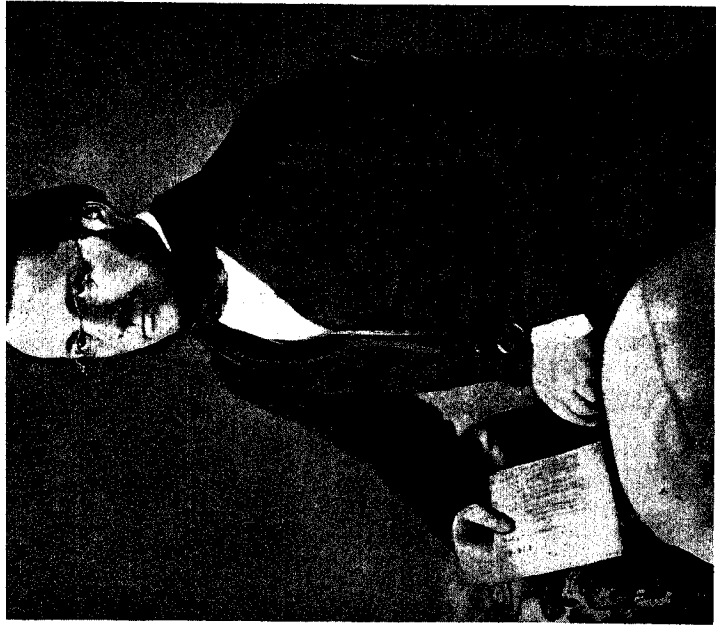
Pasteur at the age of thirty, professor at the University of Strasbourg