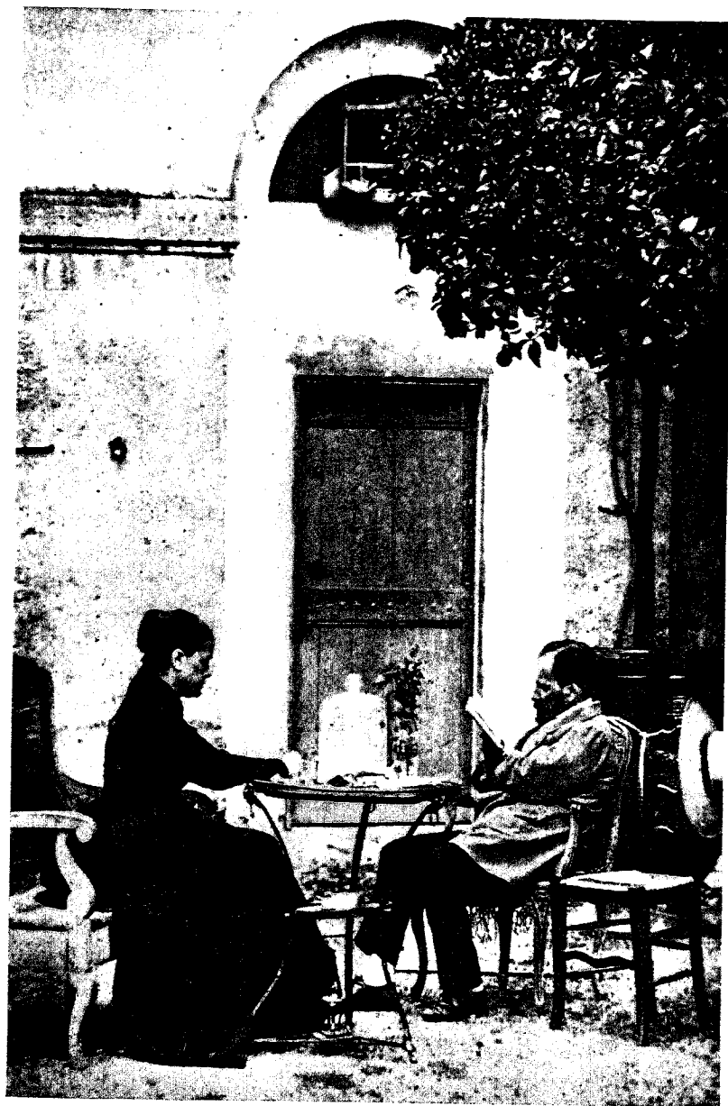
Pasteur (approximately forty-five years old) at Pont Gisquet, dictating a scientific paper to his wife